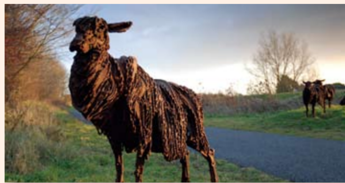
LINCOLN LONGWOOL SHEEP BY SALLY MATTHEWS

This 33 mile route was completed in 2008 and connects Lincoln to Boston. It was named in a local competition and is a pun on its former use as a railway and to celebrate the water rail and other abundant bird life that can be seen from the path.