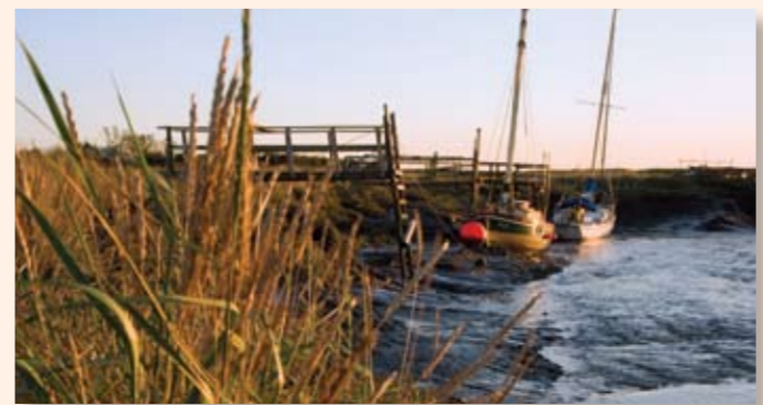
GIBRALTAR POINT WITH ITS BEAUTIFUL SALTMARSHES AND DUNES

These are all sites for cycling to, rather than cycling round and cyclists are asked to leave their cycles at the car parks/entrances and enjoy the reserves on foot.